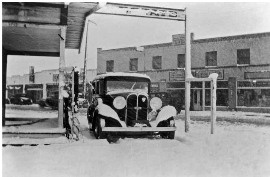
Winter in Newhall

Articles and inquiries regarding The Dispatch may be made to 254-1275